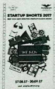
WF NEN Startup Shorts 2017.jpg 1289K